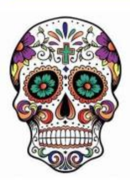
Dia de los Meurtos Day of the Dead

AO3 Recording ideas-photos and drawings AO4 Making a personal response- final ideas