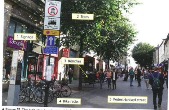
Figure 21 The high street environment in Lancas